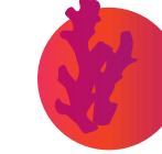
Ginger Root Extract