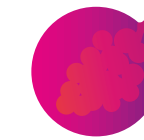
Grape Seed Extract